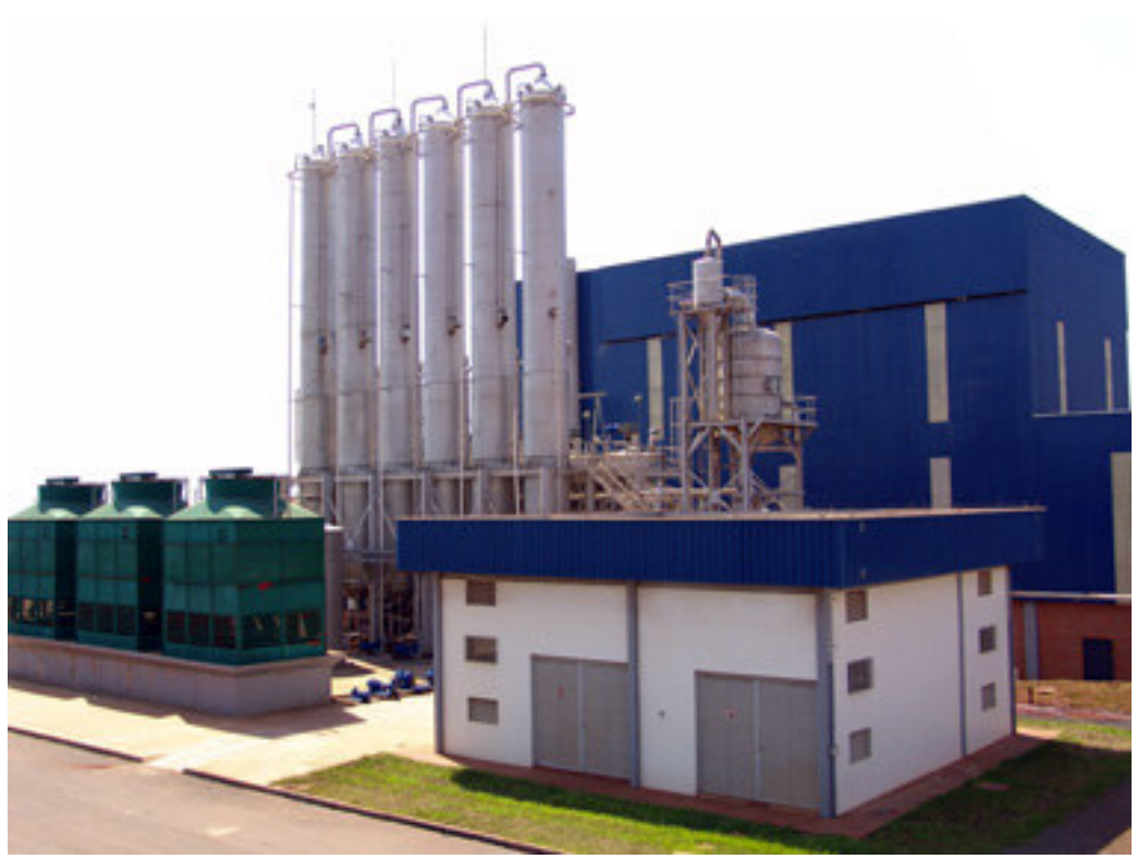
Raudi chemical salts plant, in São Carlos do Ivaí, PR, Brazil