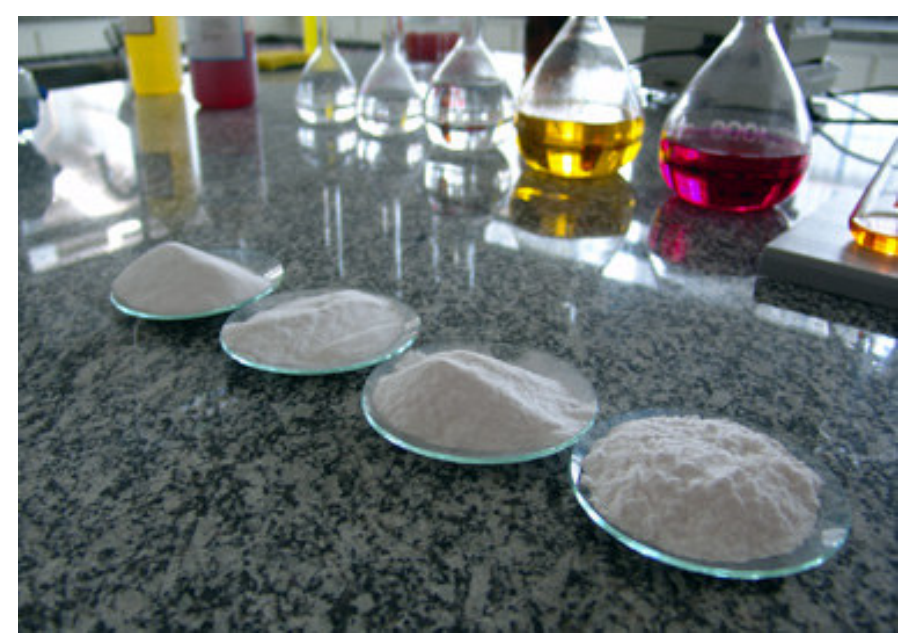
Chemical salts produced by Raudi

This template shall not be altered. It shall be completed without modifying/adding headings or logo, format or font.